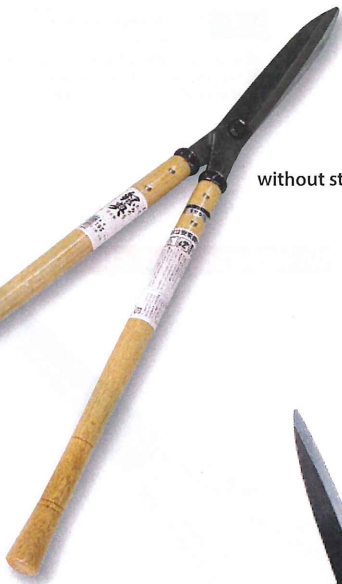
A-5 Yasuki-Hagane Clad Steel Hedge Shears Forged ■ Blade length: 180mm, Grip: 450mm ■ Weight: 980g, OAL: 685mm ■ Material: Yasugi-Hagane+Cutlery Carbon Steel Grip: Oak