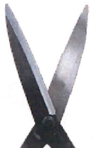
A-6 Yasuki-Hagane Clad Steel Hedge Shears Forged ■ Blade length: 195mm, Grip: 450mm ■ Weight: 1045g OAL: 705mm ■ Material: Yasugi-Hagane+Cutlery Carbon Steel Grip: White Oak