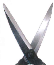
A-40 Yasuki-Hagane Clad Steel Hedge Shears 鍛造製品 ■ Blade length: 195mm, Grip: 450mm ■ Weight: 900g, OAL: 690mm ■ Material: Yasugi-Hagane+Cutlery Carbon Steel Grip: Oak