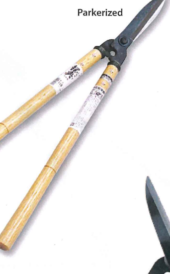
A-2 Yasuki-Hagane Clad Steel Hedge Shears Forged ■ Blade length: 150mm, Grip: 450mm ■ Weight: 895g, OAL: 650mm ■ Material: Yasugi-Hagane+Cutlery Carbon Steel Grip: Oak