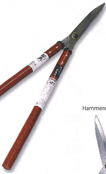
A-19 Yasuki-Hagane Clad Steel Hedge Shears Forged ■ Blade length: 180mm, Grip: 450mm ■ Weight: 965g, OAL: 680mm ■ Material: Yasugi-Hagane+Cutlery Carbon Steel Grip: Dyed Oak