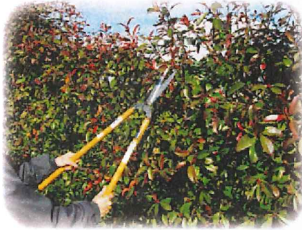
Clad steel with Yasugi special steel + cultry carbon steel

For Trimming Trimming new shoots and leaves of hedges and fences